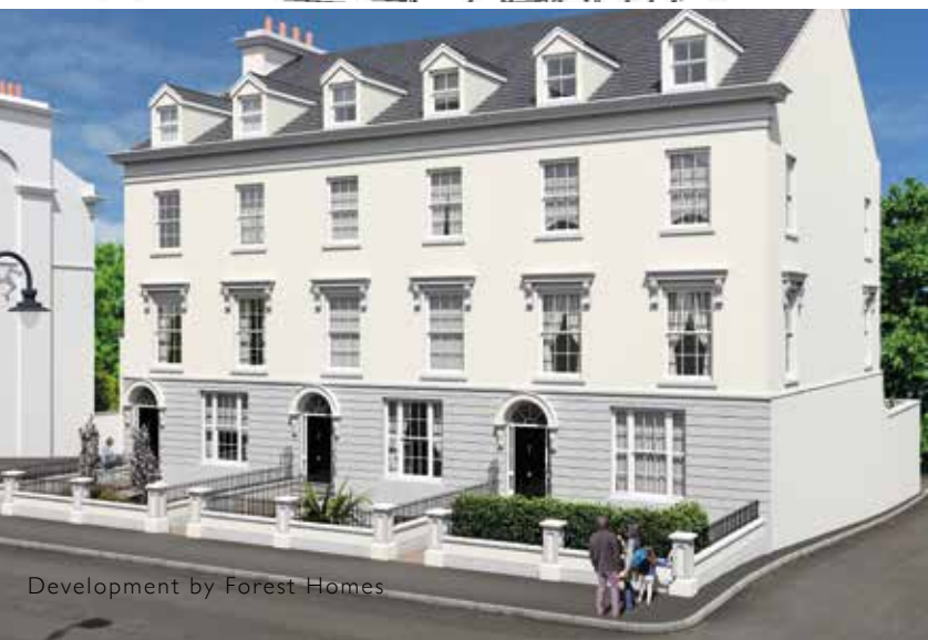
Development by Forest Homes

They will discuss your needs in detail and then produce a design scheme.