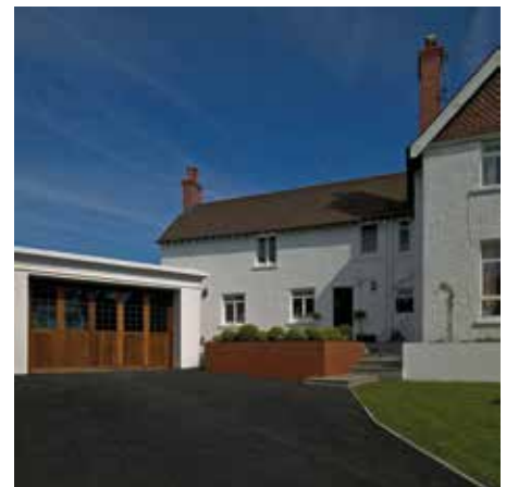
Top Rose Cottage: viewed through the woodland garden.